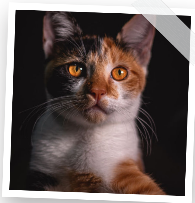
While fur babies bring us joy, their deaths leave a void in our lives.

The bond you have with your companion, and the depth of your relationship, can shape the intensity of your grief.