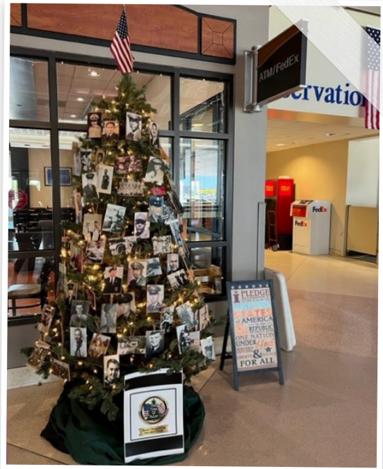
The Triad Honor Flight typically features Trees of Valor. [Photo submitted]

For more information on The Tree of Valor, visit Facebook ; the website - thetreeofvalor.org ; or email thetreeofvalor@gmail.com .