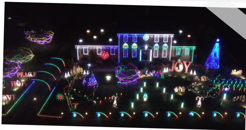
The McMasters Christmas Light Show raised $2,274.75 for AuthoraCare Collective this year.

For more details on the light show, visit The McMasters Christmas Light Show on Facebook.